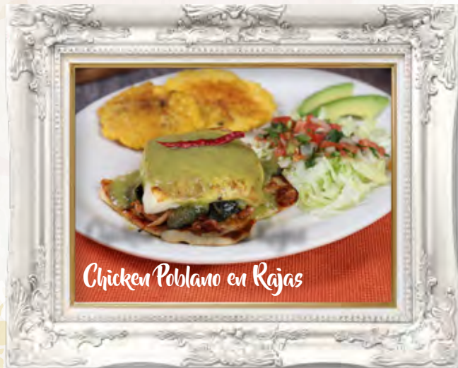
Chicken Poblano en Rajas